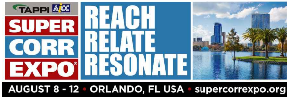
Exhibit Hall Hours: Monday: August 9 - 12:00pm-5:00pm Tuesday: August 10 - 12:00pm-5:00pm Wednesday: August 11 - 12:00pm-5:00pm Thursday: August 12 - 12:00pm-3:00pm

TAPPI/AICC SuperCorrExpo August 9-12, 2021 Orange County Convention Center North Complex Hall AB, Level 1 Orlando, FL USA